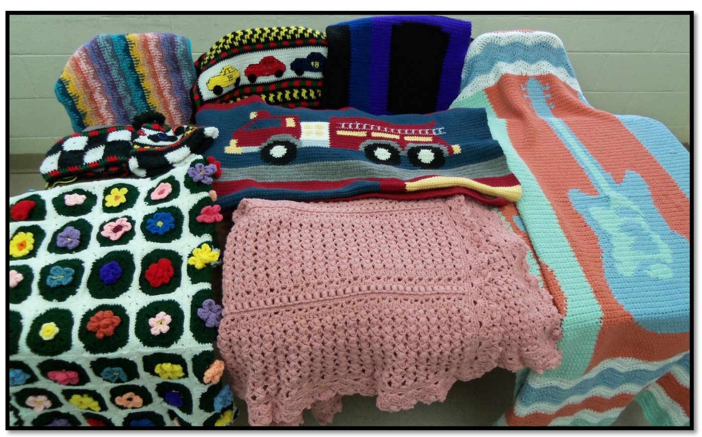
Return to Main Page

Since the Character Craft Program receives no funding, it has been amazing to see the outpouring of community support it has received. Without this support the Program could not exist. Additionally, Greenwood and the surrounding communities are given a different, positive view of inmates and what they can achieve with support